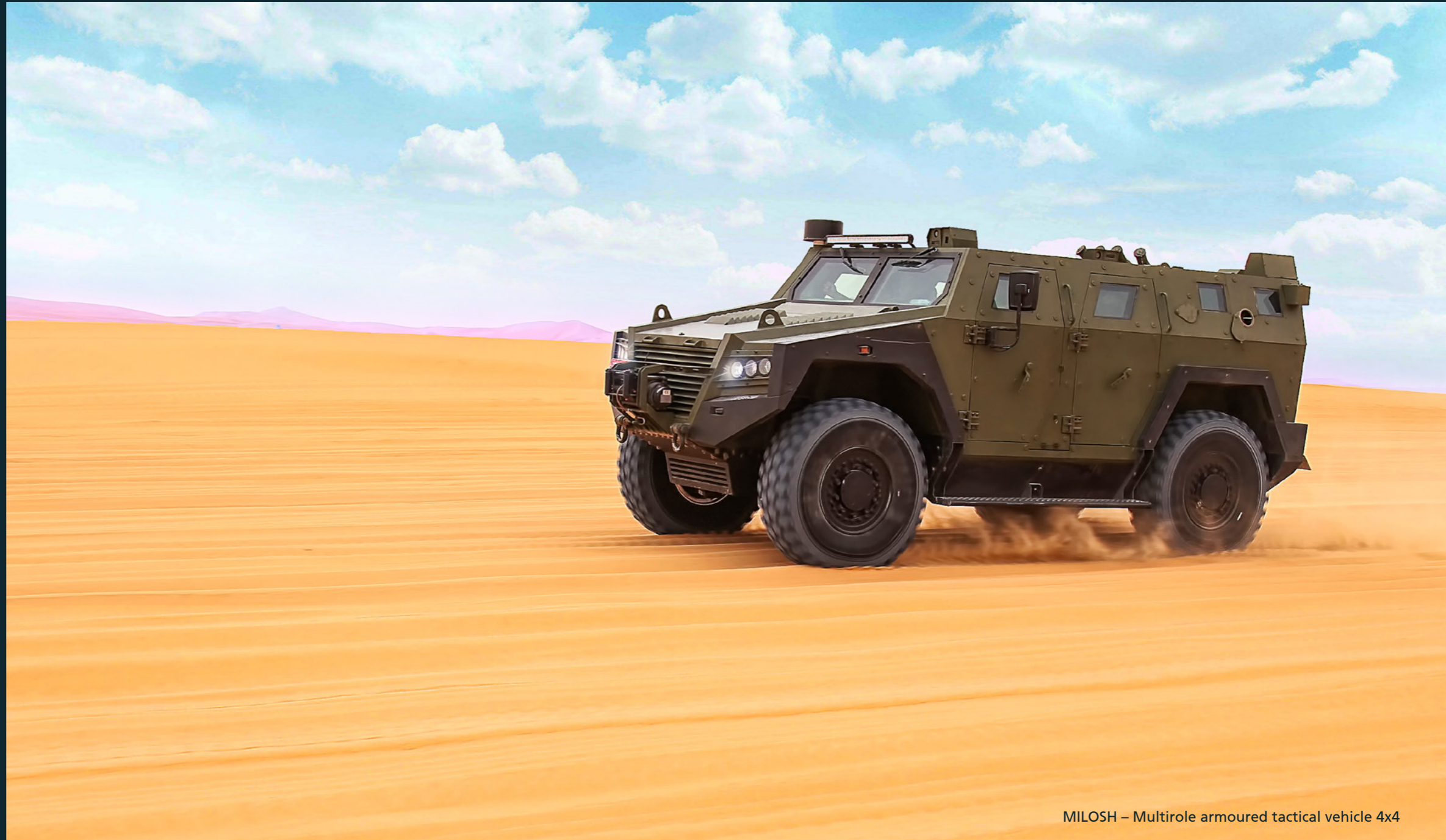
MILOSH – Multirole armoured tactical vehicle 4x4