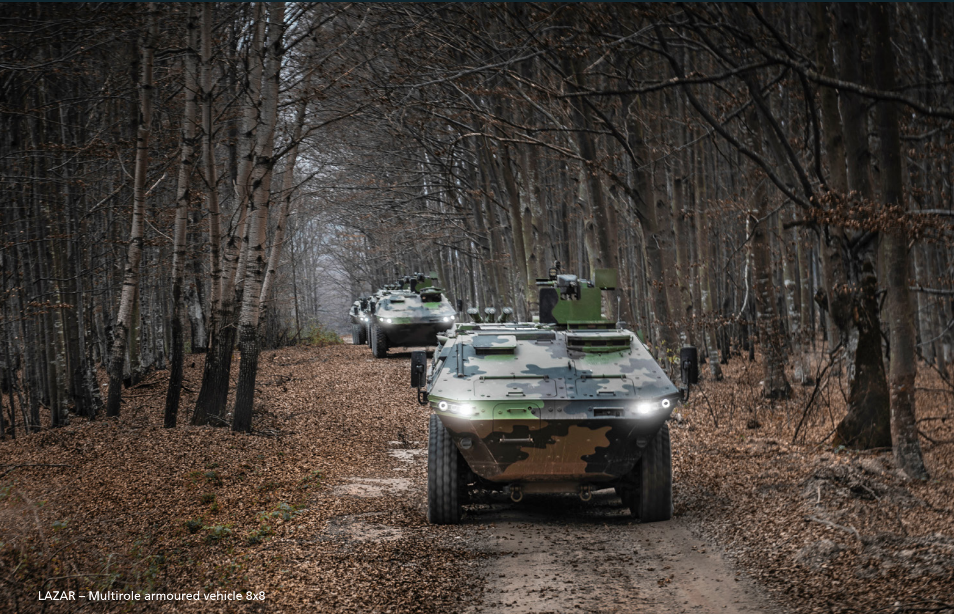
LAZAR – Multirole armoured vehicle 8x8