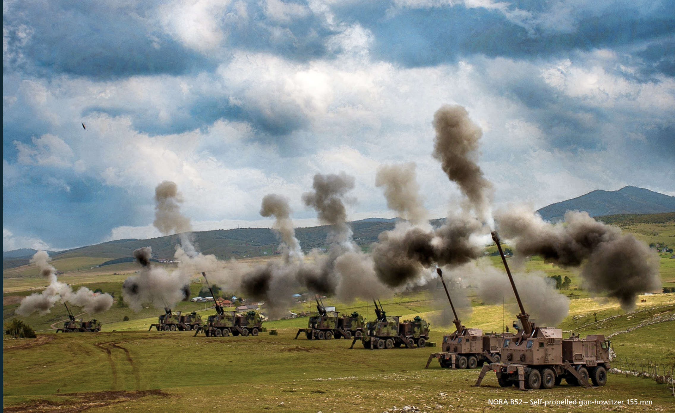
NORA B52 – Self-propelled gun-howitzer 155 mm

Quality policy is an integral part of Yugoimport-SDPR's business policy, representing a management tool for achieving well-defined business objectives. For many years now, Yugoimport-SDPR has maintained the globally recognized proof of quality, the ISO 9001 Certificate, demonstrating its compliance with the highest standards, and ensuring continued business excellence.